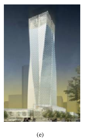
Fig. 2. Diagrid buildings: (a) Swiss Re in London, (b) Hearst Tower in New York, (c) Cyclone Tower in Asan (Korea), (d) Capital Gate Tower in Abu Dhabi and (e) Jinling Tower in china.